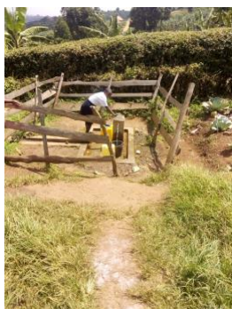
New protected spring water tap

The Samaritan Fund is continuing to help especially needy girls. For the first time this year we have also been providing sanitary pads to all the girls in the school, irrespective of need. This is a very valuable benefit to the girls, and also to the school, as it makes it more attractive for students to attend. The cost of sanitary pads is £10 per student per year and is partly being met from general funds and partly from specific donations so more assistance is always welcome. As a follow on from this programme we are also looking at how we could provide a new incinerator to dispose of sanitary waste.